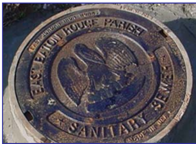
One of the first steps in rehabilitation includes a physical inspection of manholes and pipes to identify blockages.

Rehabilitation of the sewer collection system is a comprehensive physical process that begins with cleaning and inspection of sewer pipes and manholes. Typical rehabilitation repairs include pipe and manhole replacement and trenchless technologies that minimize above ground disturbances, such as cured-in-place pipe liners.