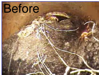
Simply cleaning the pipes and manholes in preparation for the physical inspection removes blockages, debris and roots.